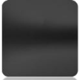
BLACK POWDER COATED